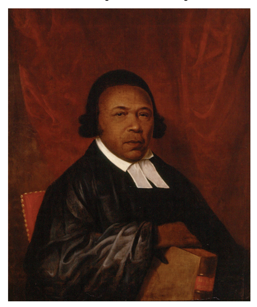
The Feast of Absalom Jones Virtual Evening Prayer February 13, 2022 5pm