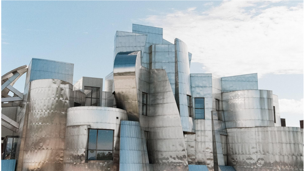
Weisman Museum on the University of Minnesota campus

outdoor sculpture garden), and the Frank Gehry-designed Weisman Art Museum. Discover our cultural heritage at the Minnesota History Center, and explore the Science or Children’s Museums. Whether or not you have children, you can hunt for the woolly mammoth and the giant beaver at the Bell Museum, Minnesota’s own natural history museum (less than a mile from the church).