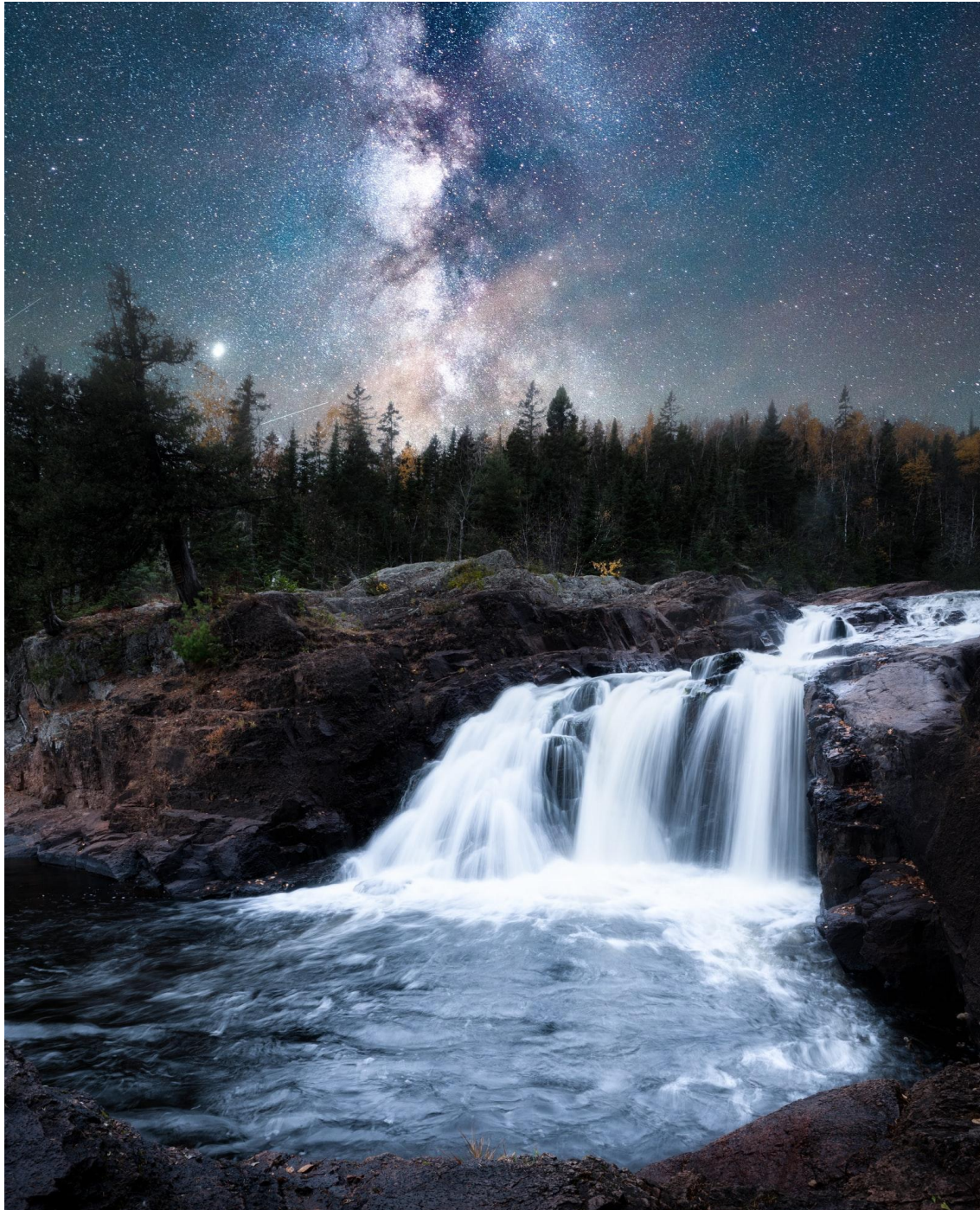
The Milky Way shines over a North Shore waterfall.

Minnesota's 66 state parks are within easy driving distance of the Twin Cities. Heading north, the Boundary Waters wilderness and the North Shore of Lake Superior are favorite destinations for canoeing, kayaking, hiking, and camping. If golf is your game, tee off at one of many golf courses spread throughout the area. (You can find disc golf courses as well.) Winter brings snow and cold, but also many highlights, including St. Paul's Winter Carnival – a 17-day extravaganza – and the candle-lit Luminary Loppet festival on and around