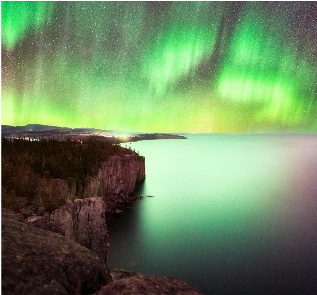
Northern lights shimmer over Lake Superior.

Finally, the Twin Cities offers a wide variety of excellent school options for elementary and secondary schools, including public, private, religious and charter schools. World class medical care is available in the Twin Cities; a little over an hour away is the world renowned Mayo Clinic. Travel in and out of the region is convenient: the Minneapolis-St. Paul airport (oft-cited as one of the best in the country) is located between both cities.