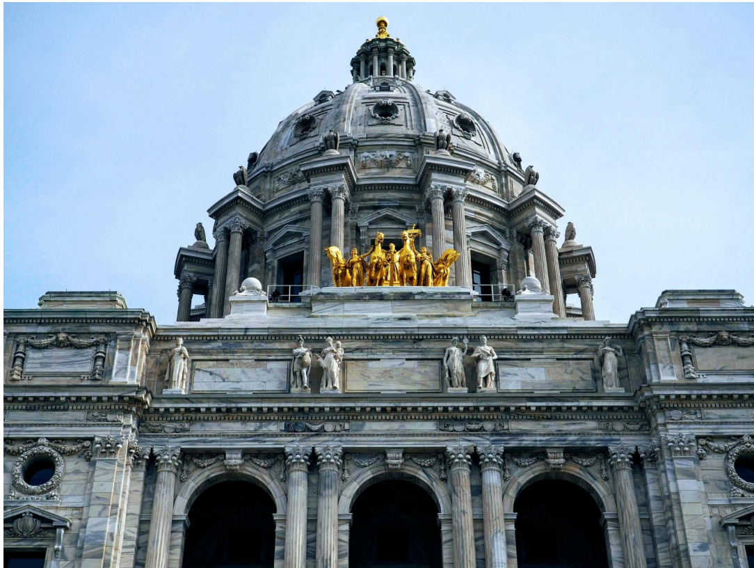
State Capitol Building in St. Paul

The Twin Cities area (shorthand for the combined metro region, including St. Paul, Minneapolis, and their suburbs) is home to 60% of Minnesota's 5.7 million residents. The Cities are a vibrant place to live, with an impressive variety of opportunities that appeal to nearly any interest. Among the many benefits of this cultural diversity is a wide spectrum of cuisine, from restaurants featuring James Beard Award-winning chefs to African, Caribbean, Chinese, Hmong, Latin American, Mediterranean, Spanish, Thai, and Vietnamese flavors (among others), as well as variations on American and European favorites. We have lots of ways to satisfy both your curiosity and your palate.