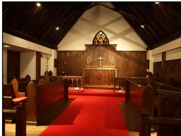
Old chapel worship space today

2006-2007. Narthex, then the main sanctuary areas remodeled and refurnished, including a new baptismal font and altar.