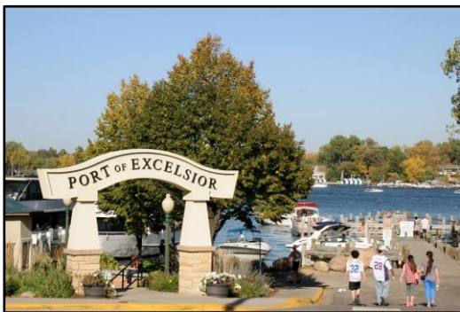
Port of Excelsior 1 block from Trinity Church