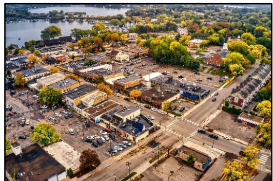
City of Excelsior along Lake Minnetonka