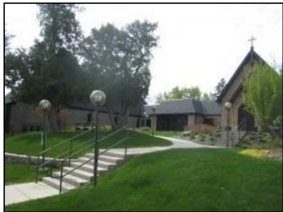
Trinity church present day