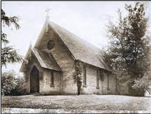
Original church built in 1855